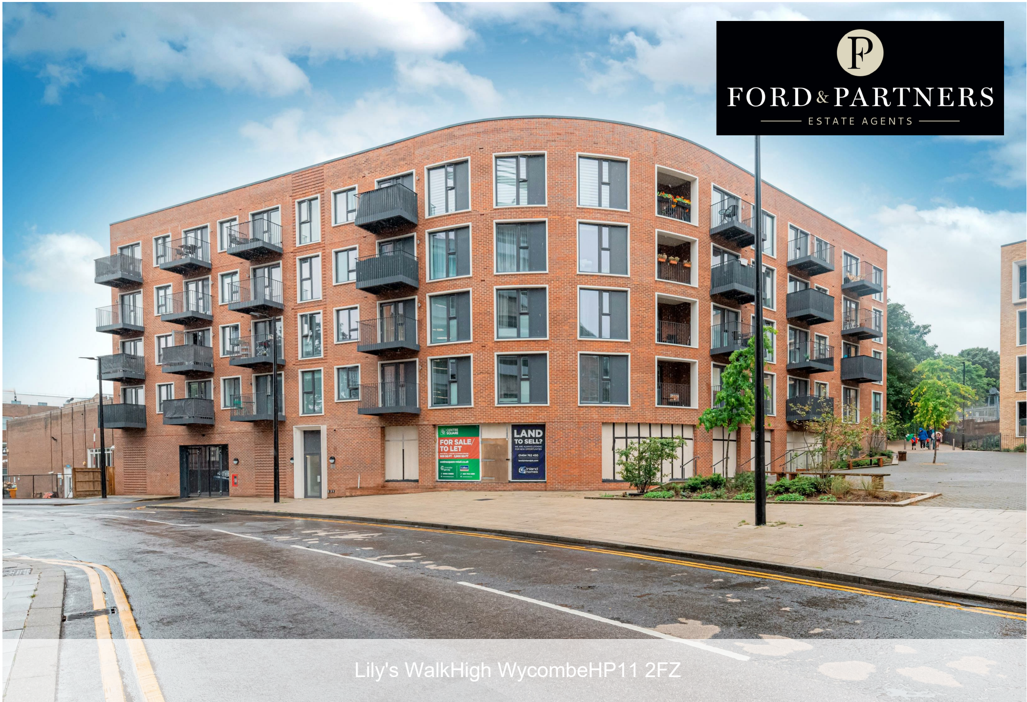
Lily's Walk High Wycombe HP11 2FZ