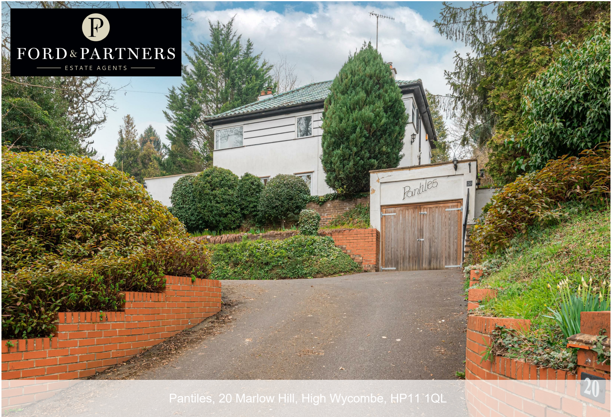
Pantiles, 20 Marlow Hill, High Wycombe, HP11 1QL