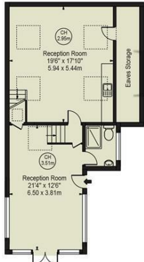
Raised Ground Floor (754 Sq Ft - 70.05 Sq M)