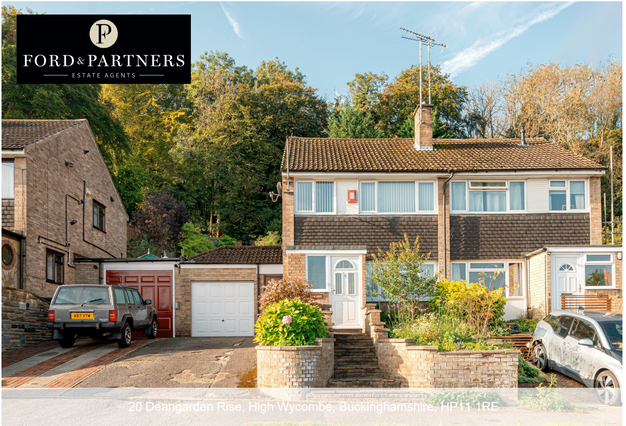
20 Deangarden Rise, High Wycombe, Buckinghamshire, HP11 1RE