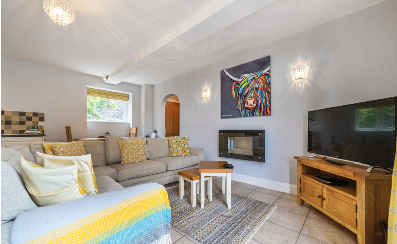
Open Plan Living Room / Dining Kitchen