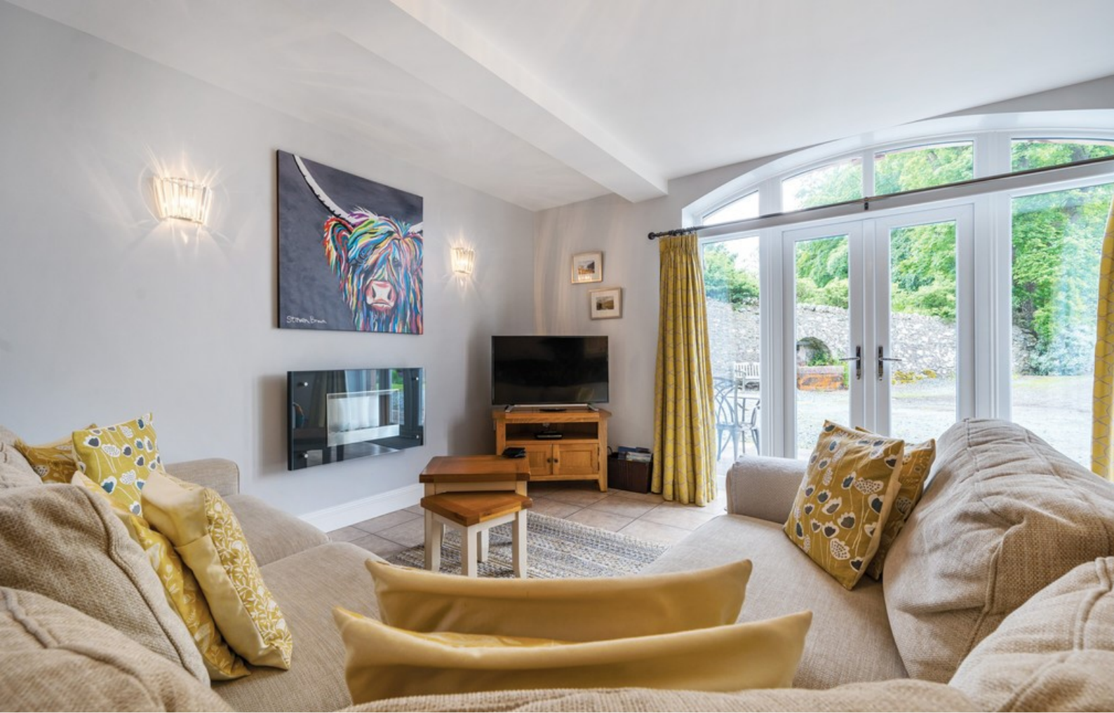
Open Plan Living Room / Dining Kitchen