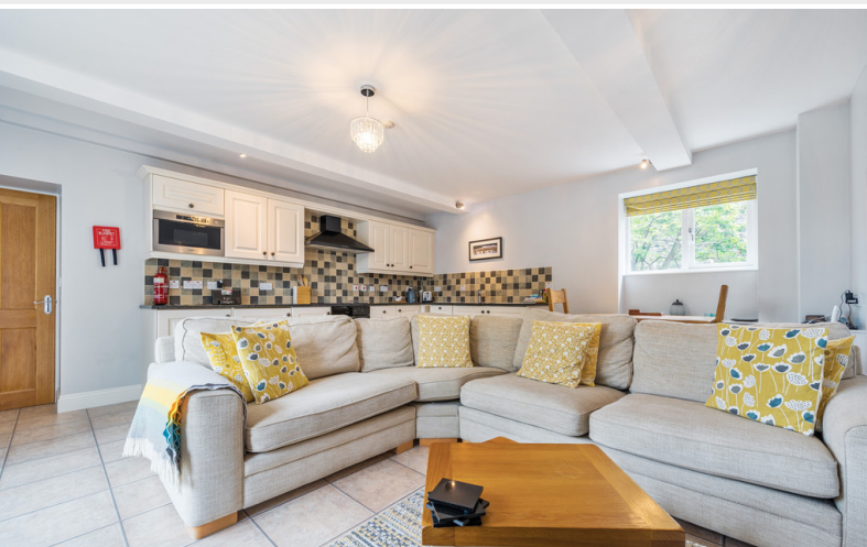
Open Plan Living Room / Dining Kitchen