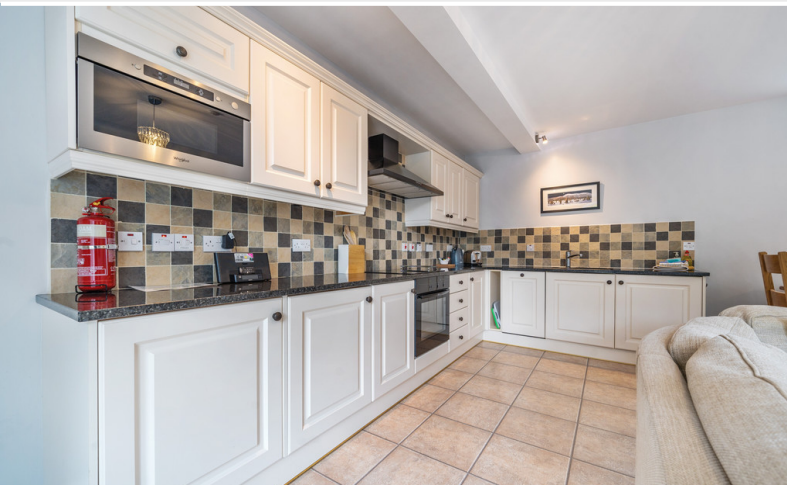
Open Plan Living Room / Dining Kitchen