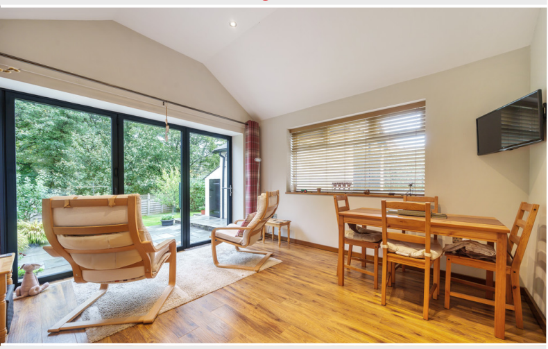
Dining / Family Room