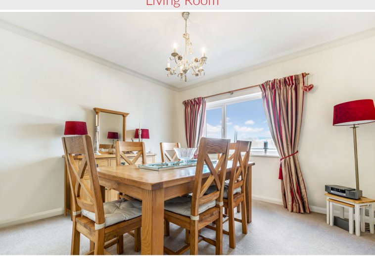
Dining Room or Additional Bedroom