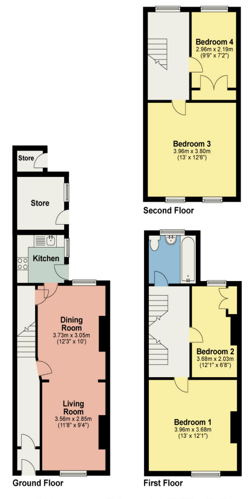
Total area: approx. 97.4 sq. metres (1048.4 sq. feet) For illustrative purposes only. Not to scale.

All permits to view and particulars are issued on the understanding that negotiations are conducted through the agency of Messrs. Hackney & Leigh Ltd. Properties for sale by private treaty are offered subject to contract. No responsibility can be accepted for any loss or expense incurred in viewing or in the event of a property being sold, let, or withdrawn. Please contact us to confirm availability prior to travel. These particulars have been prepared for the guidance of intending buyers. No guarantee of their accuracy is given, nor do they form part of a contract. *Broadband speeds estimated and checked by <a href="https://checker.ofcom.org.uk/en-gb/broadband-coverage">https://checker.ofcom.org.uk/en-gb/broadband-coverage</a> on 04/03/2025.