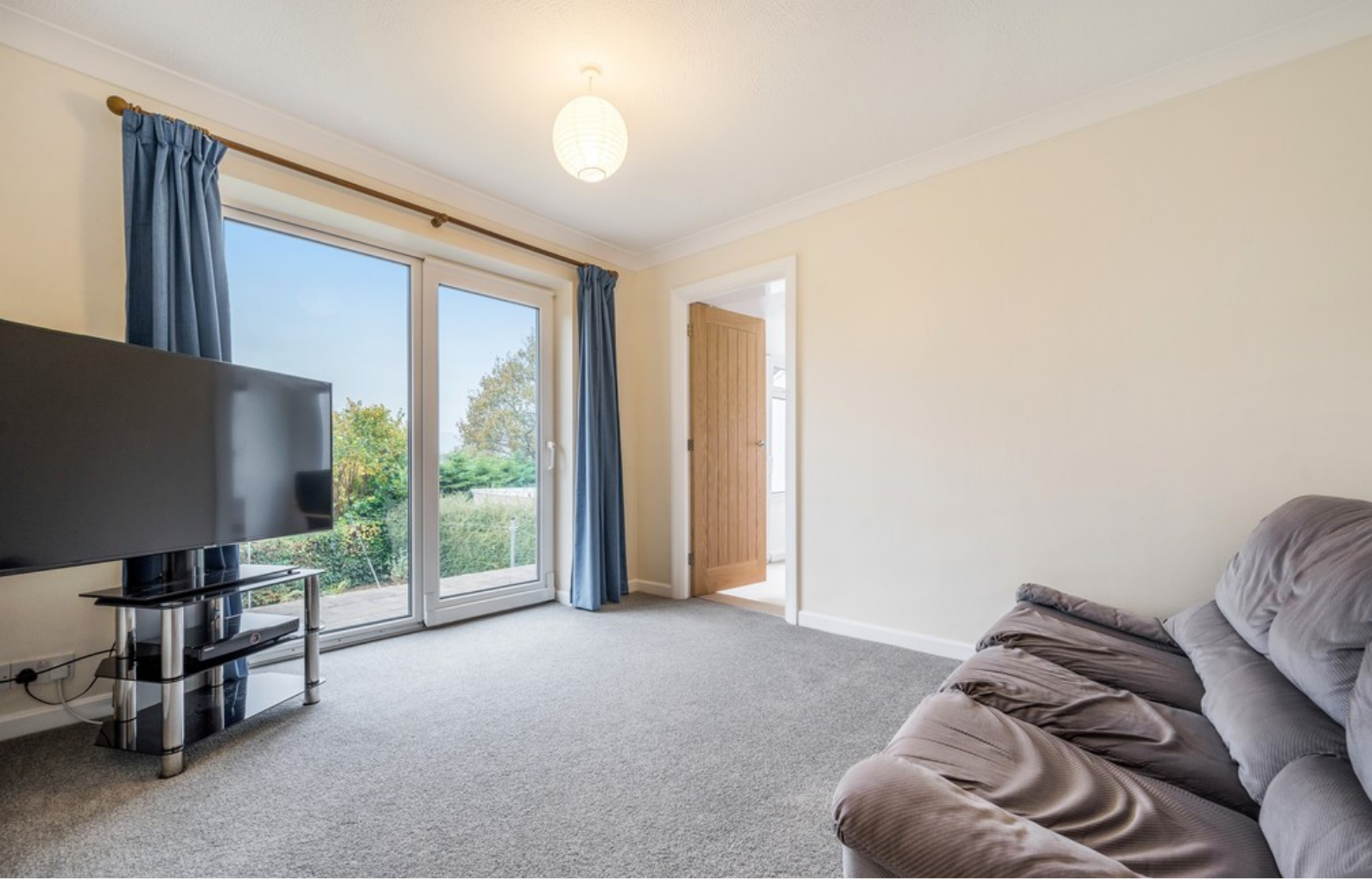
Bedroom Two / Sitting Room