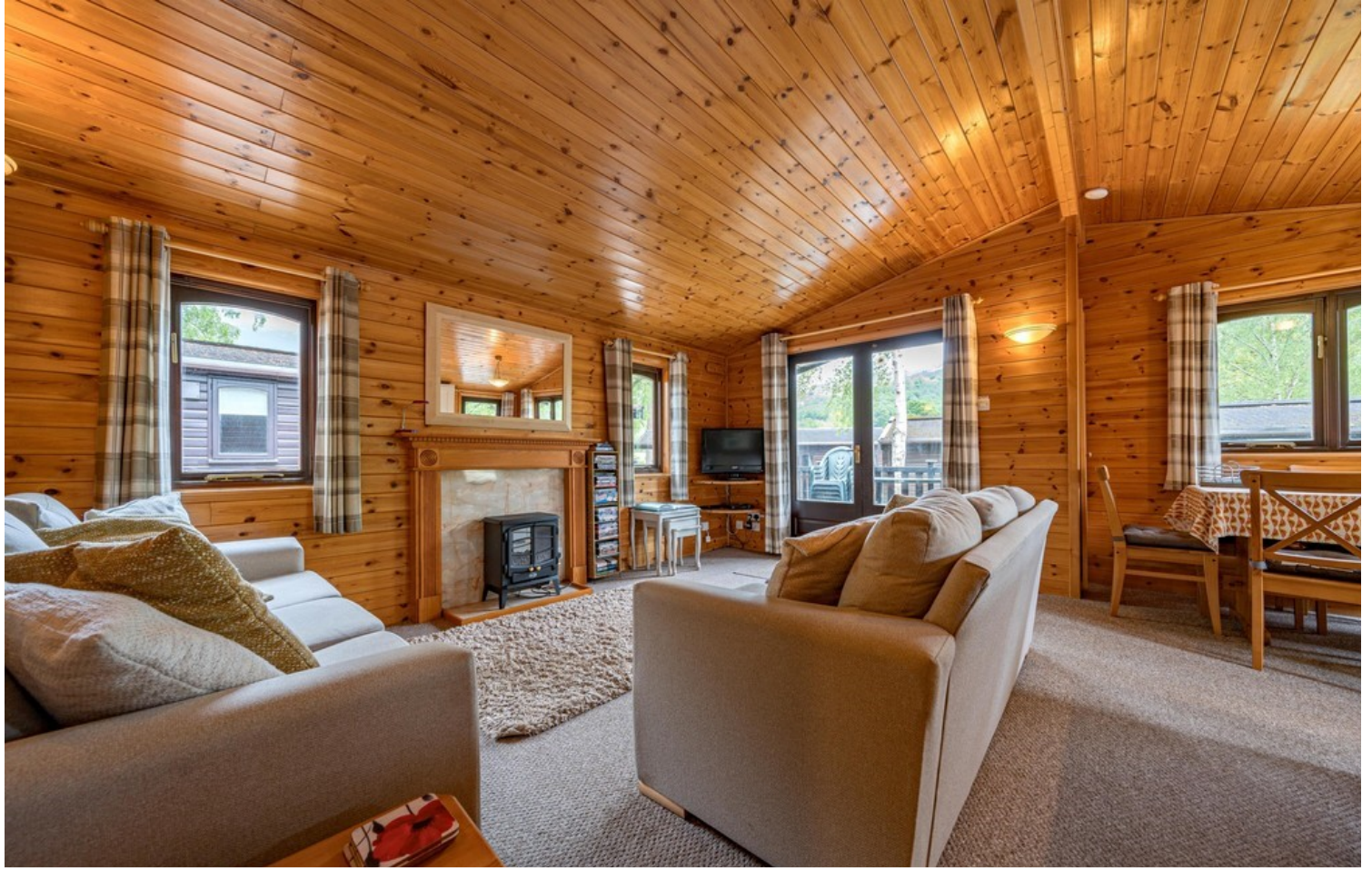
Open Plan Living Room / Dining Kitchen