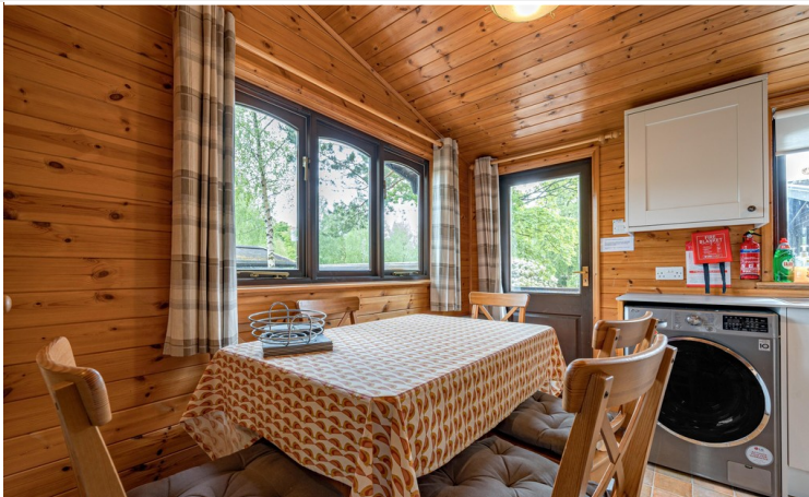
Open Plan Living Room / Dining Kitchen