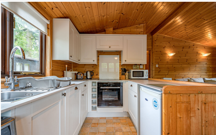
Open Plan Living Room / Dining Kitchen