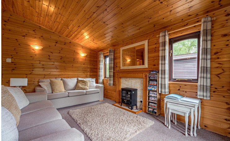
Open Plan Living Room / Dining Kitchen