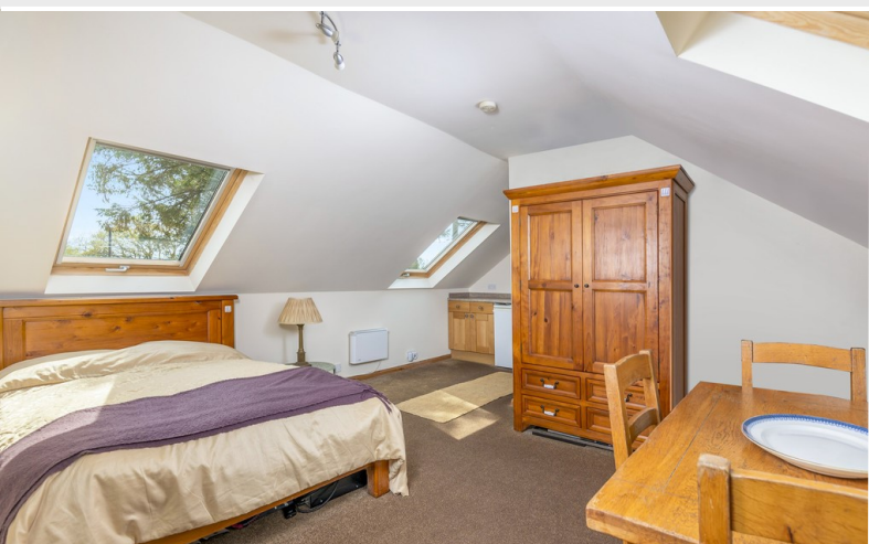
First Floor Apartment