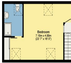
First Floor Apartment