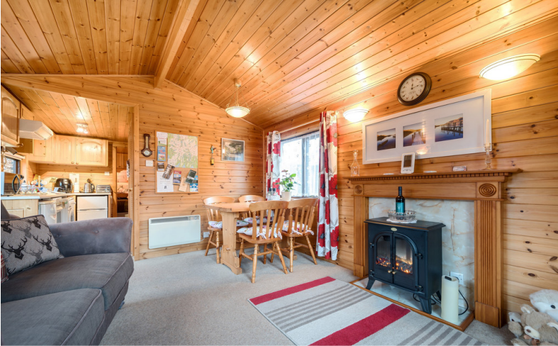
Living / Dining Room