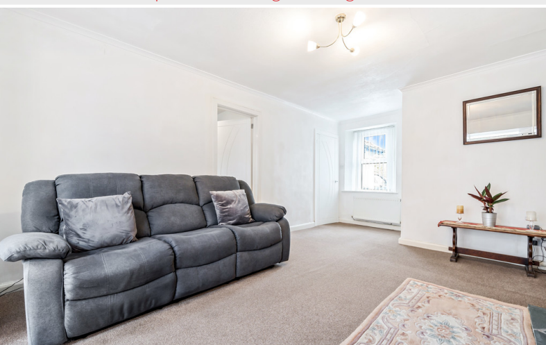
Open Plan Living / Dining Room