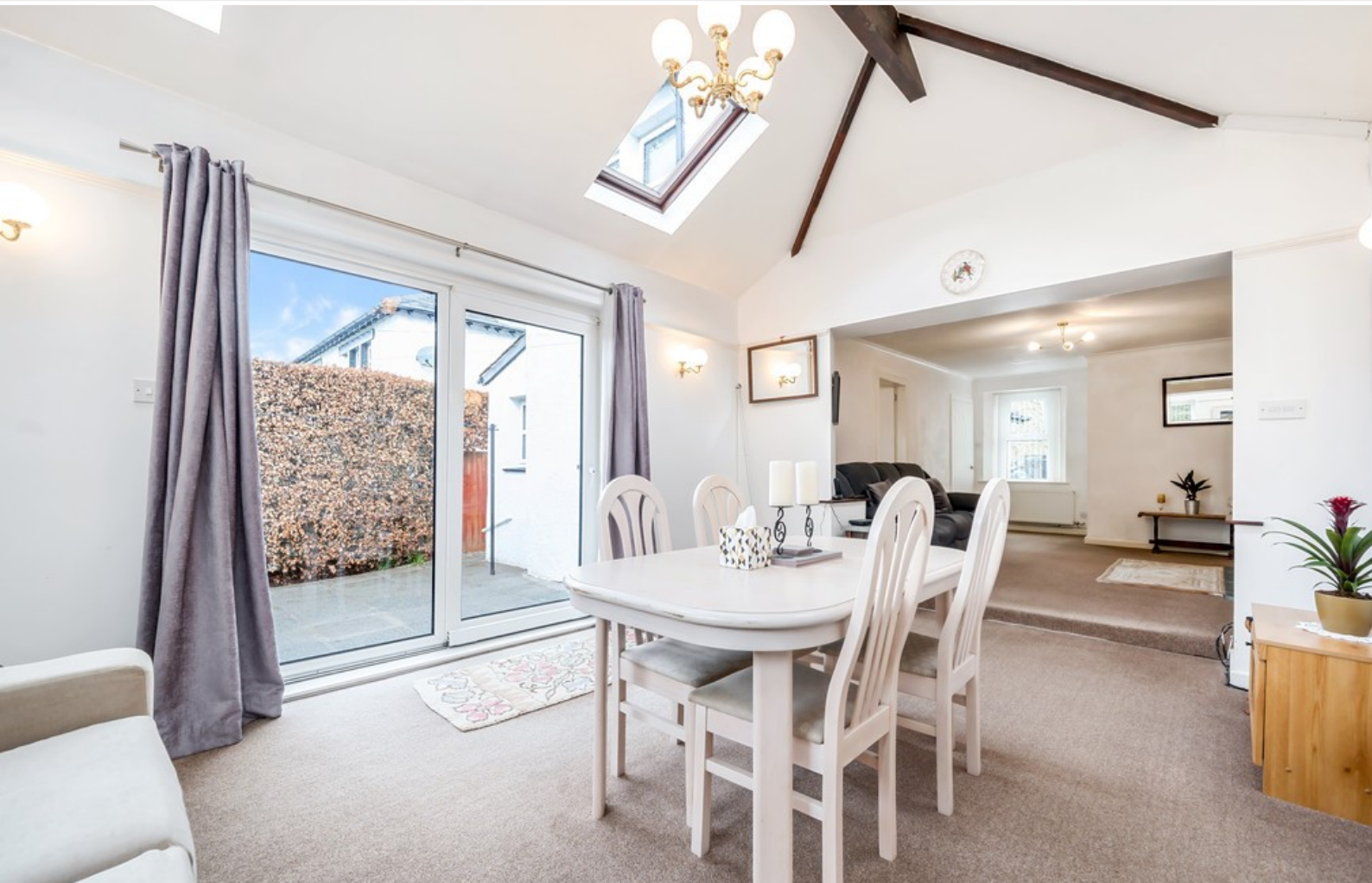
Open Plan Living / Dining Room