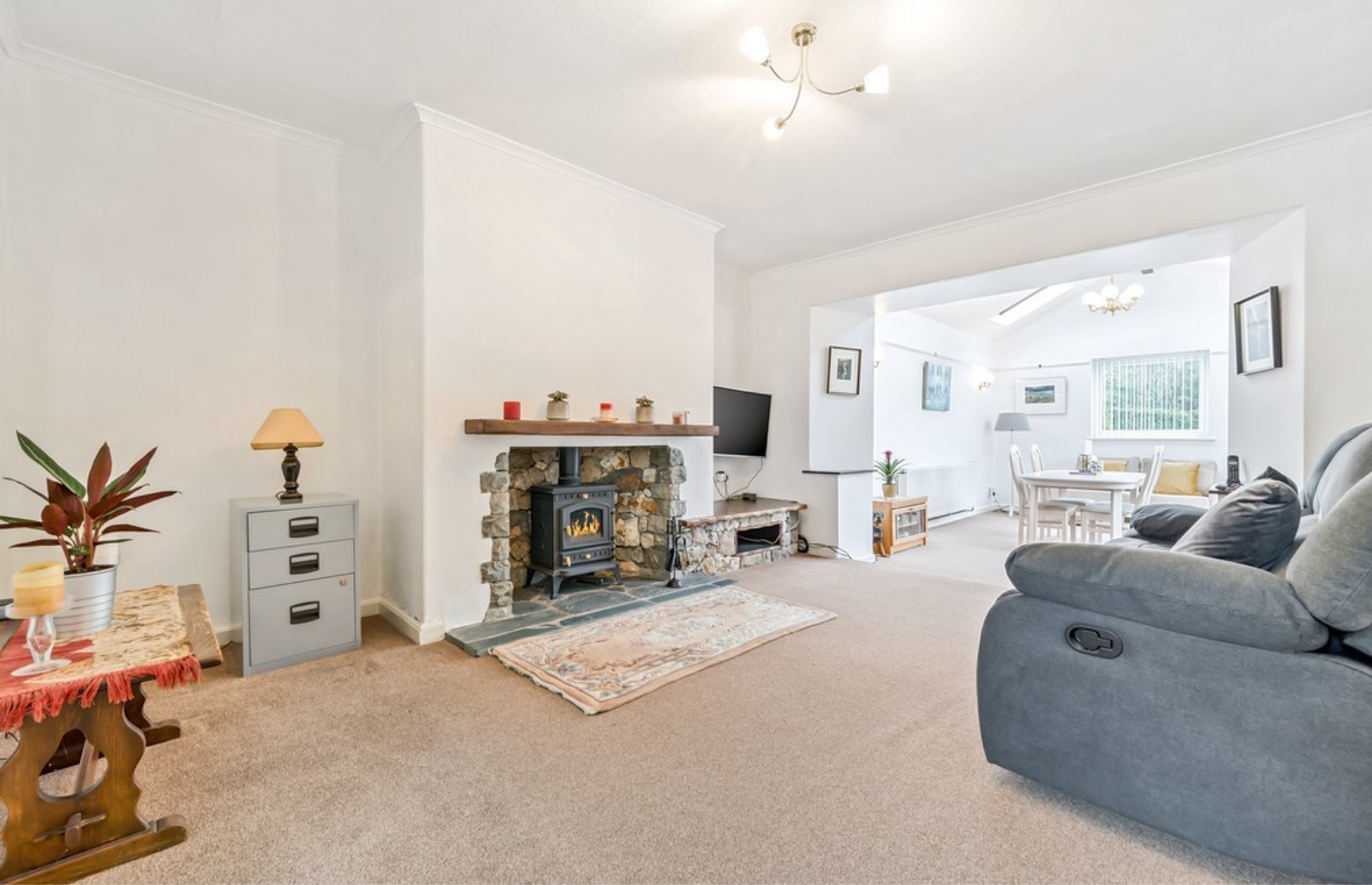
Open Plan Living / Dining Room