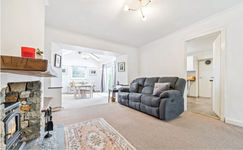
Open Plan Living / Dining Room