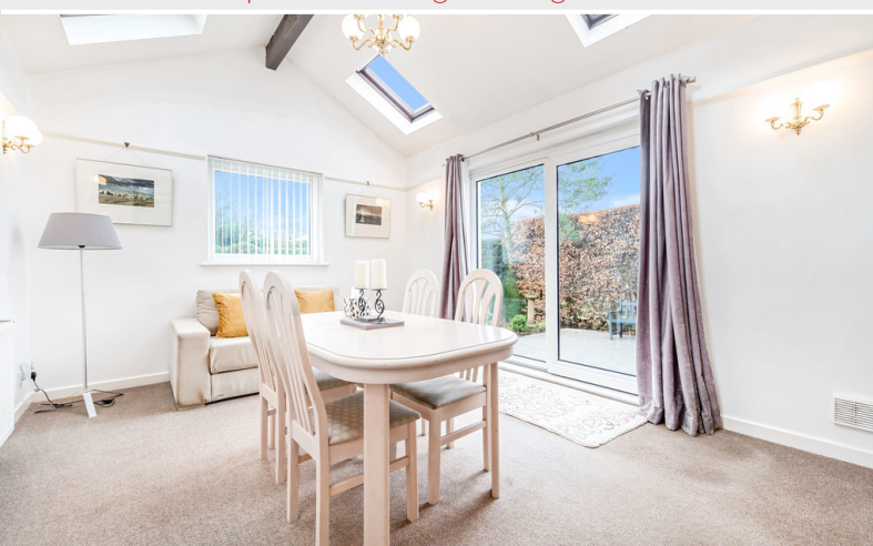
Open Plan Living / Dining Room