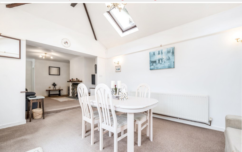
Open Plan Living / Dining Room