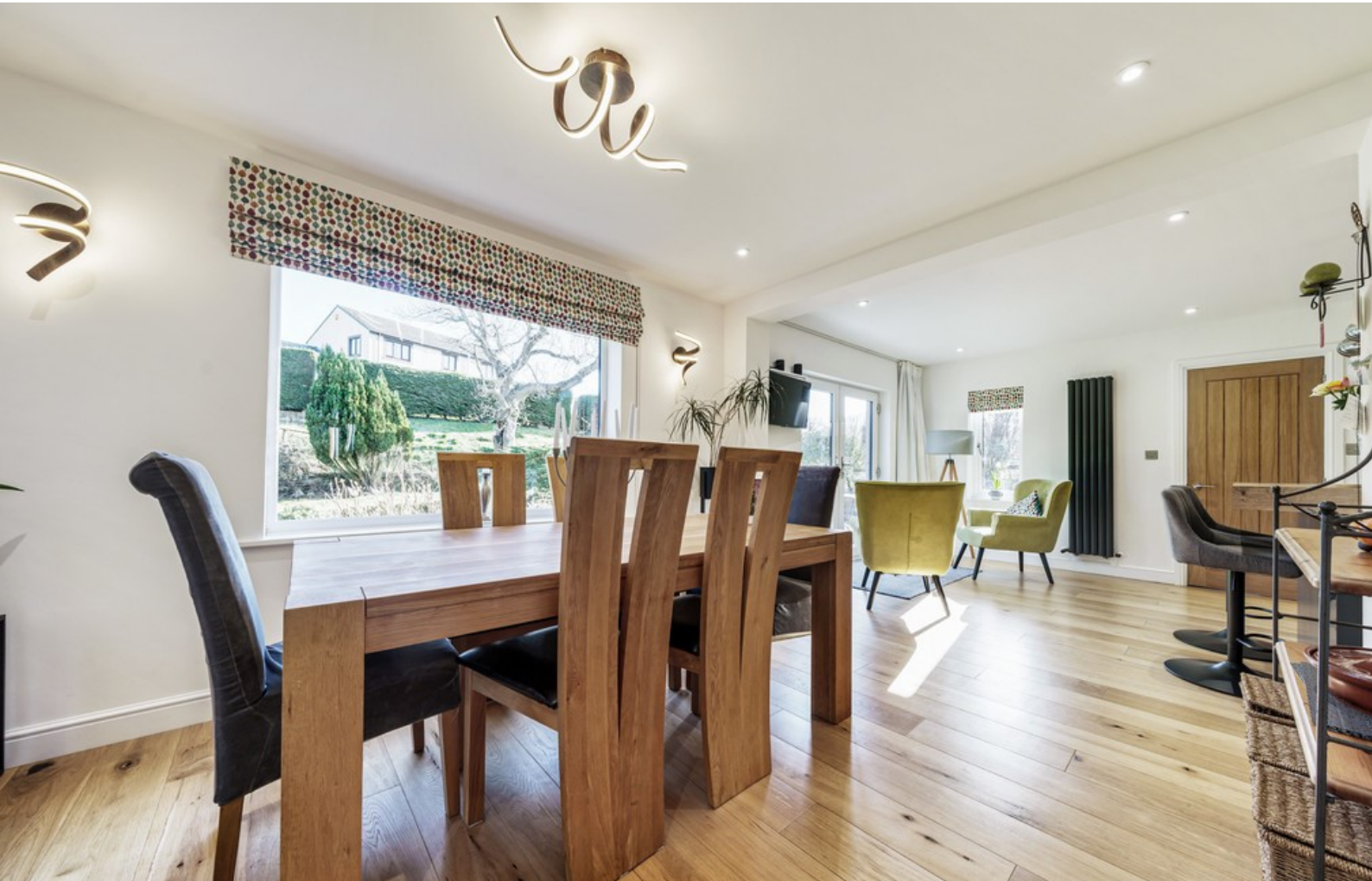
Open Plan Dining Kitchen / Sitting Room