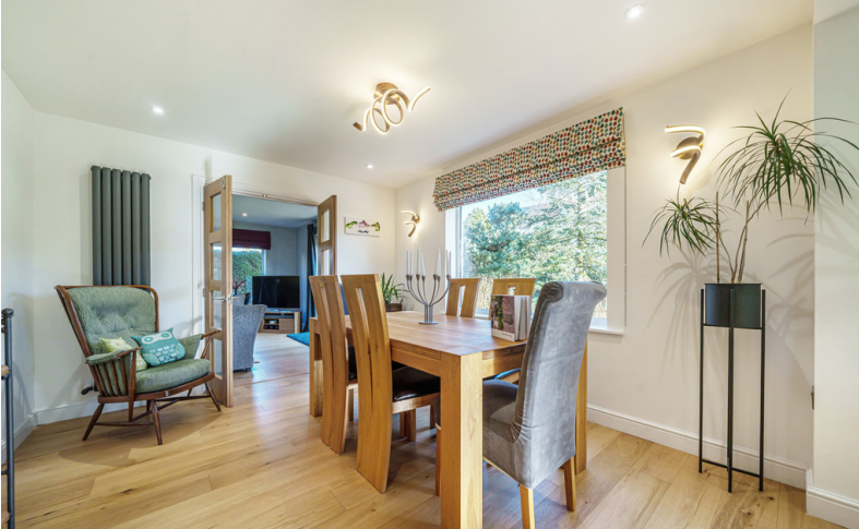
Open Plan Dining Kitchen / Sitting Room