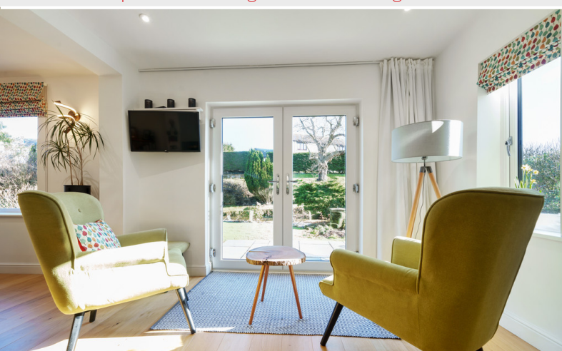
Open Plan Dining Kitchen / Sitting Room