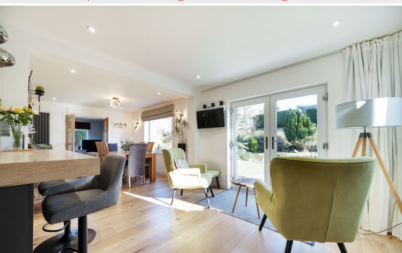
Open Plan Dining Kitchen / Sitting Room