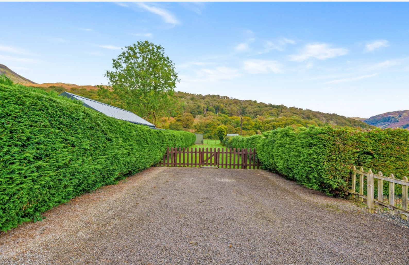
Rear Allocated Parking Area