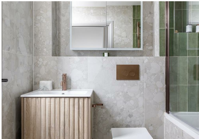
Bathroom 6'2" x 7'2"