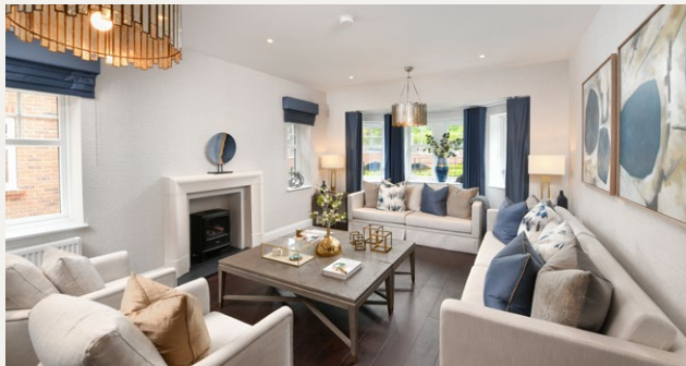
Image from previous St Edward development, indicative only