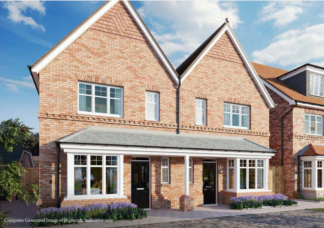
Computer Generated Image of Highcroft, indicative only