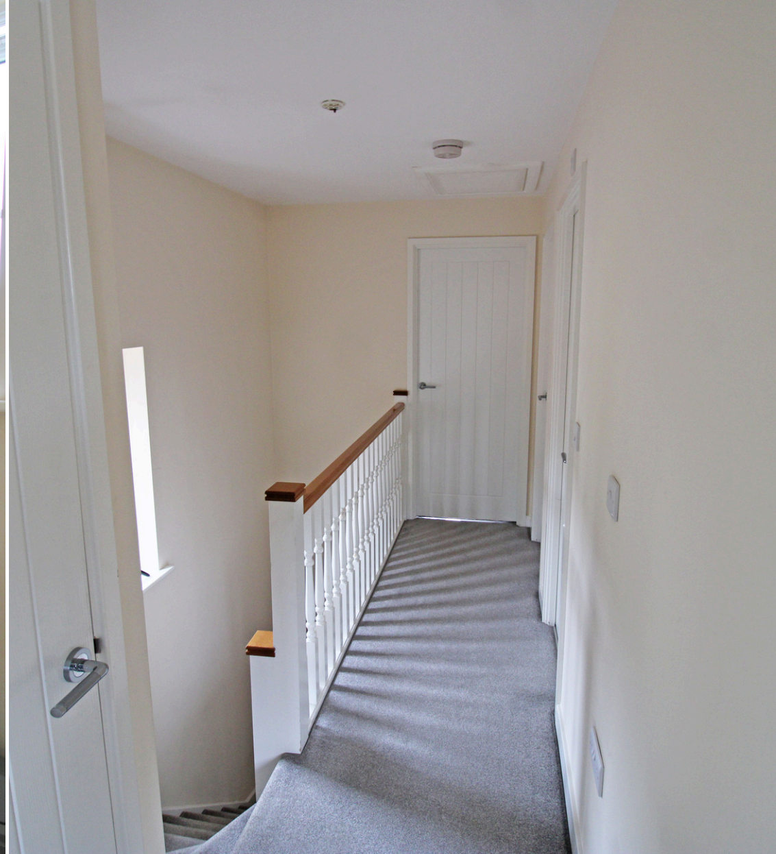
LANDING: 13' 7" x 6' 4" (4.14m x 1.93m)