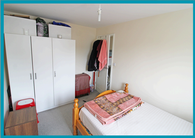
BEDROOM 2: 12' 1" X 8' 2" (3.68M X 2.49M)