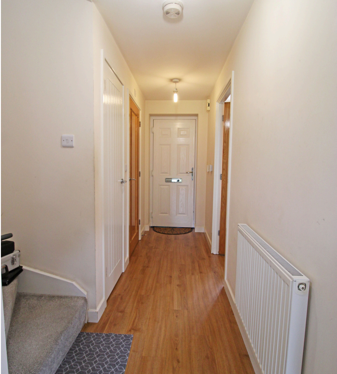
ENTRANCE HALLWAY: 13' 1" x 3' 6" (3.98m x 1.07m)