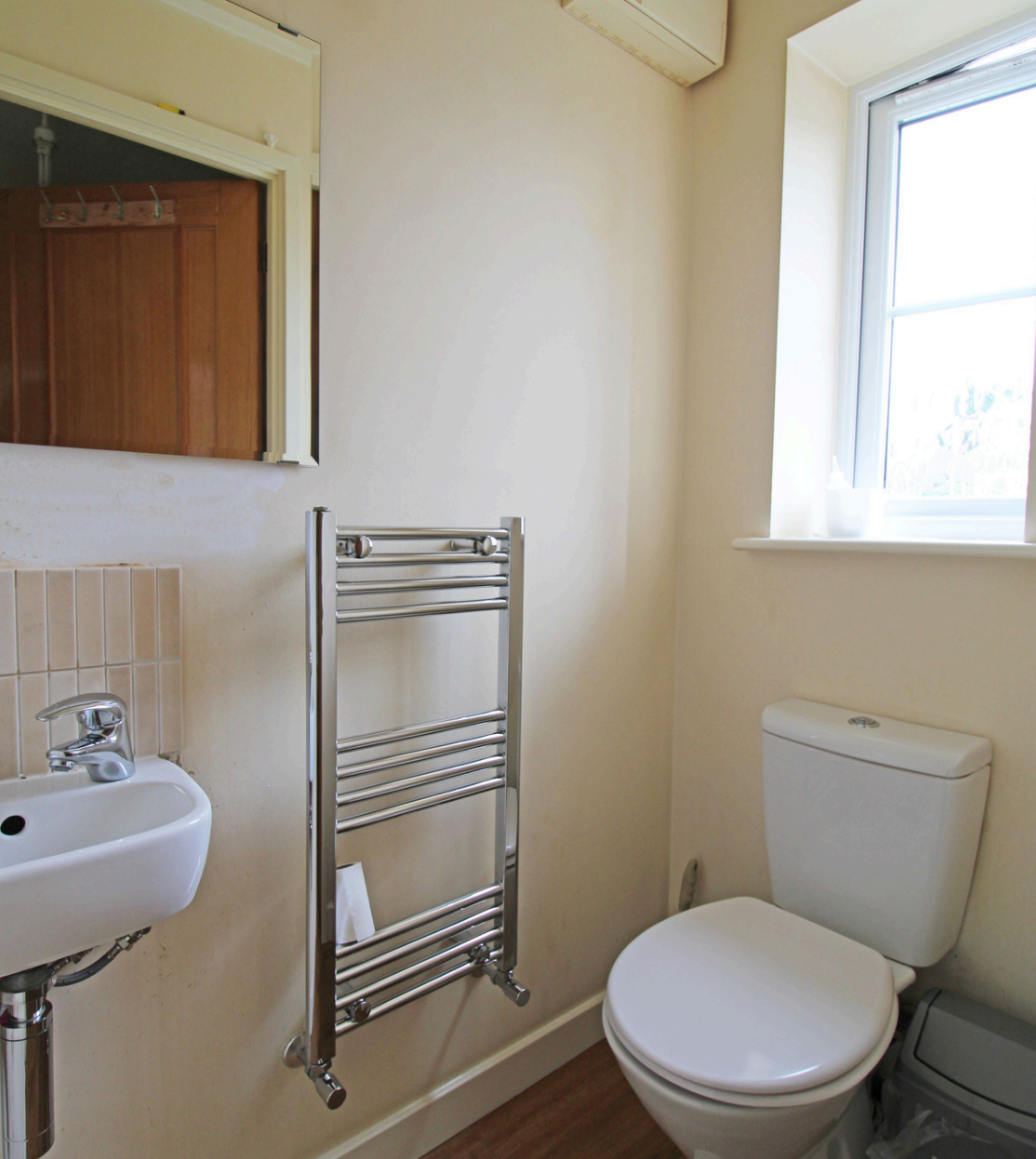
WC: 4' 10" x 2' 11" (1.47m x 0.89m)