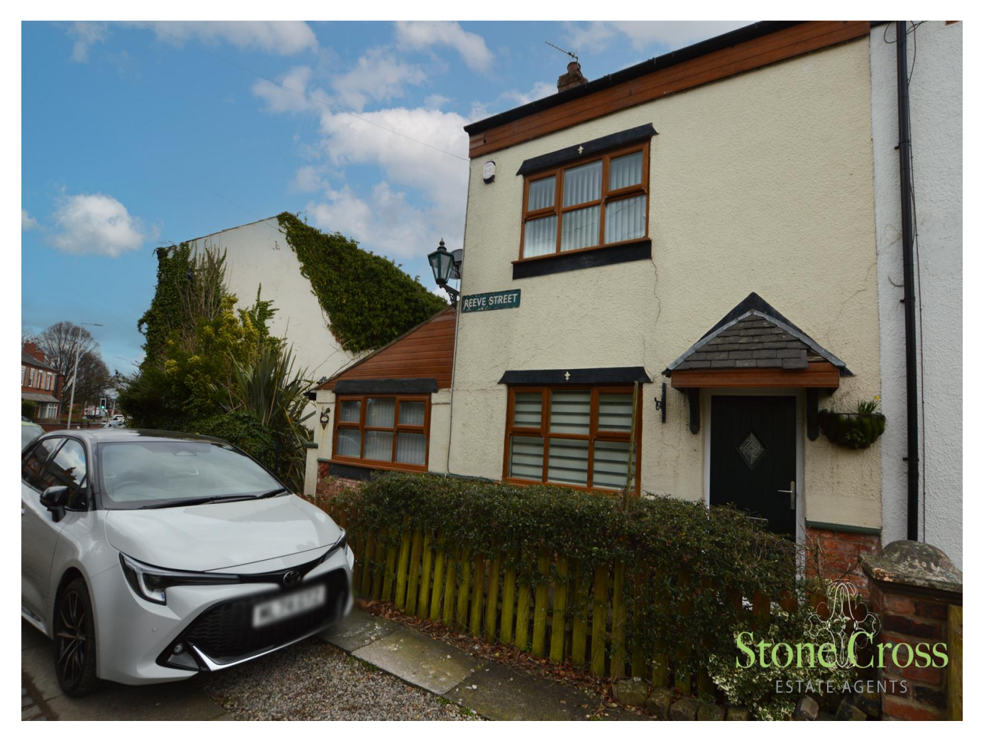
Reeve Street, Lowton, WA3 1EJ

Stone Cross Estate Agents are delighted to present this two bedroom semi detached property situated in close proximity to local transport links and the East Lancashire Road, as well as being surrounded by desirable amenities, this cottage presents an excellent opportunity. The property comprises of a lounge, kitchen, orangery and an additional reception room to the ground floor. Upstairs promotes two double bedrooms and a family bathroom. Externally the property boasts an enclosed rear garden with mature shrubbery and off road parking to the front. Don't miss out - book a viewing now and secure your chance to own this charming property!