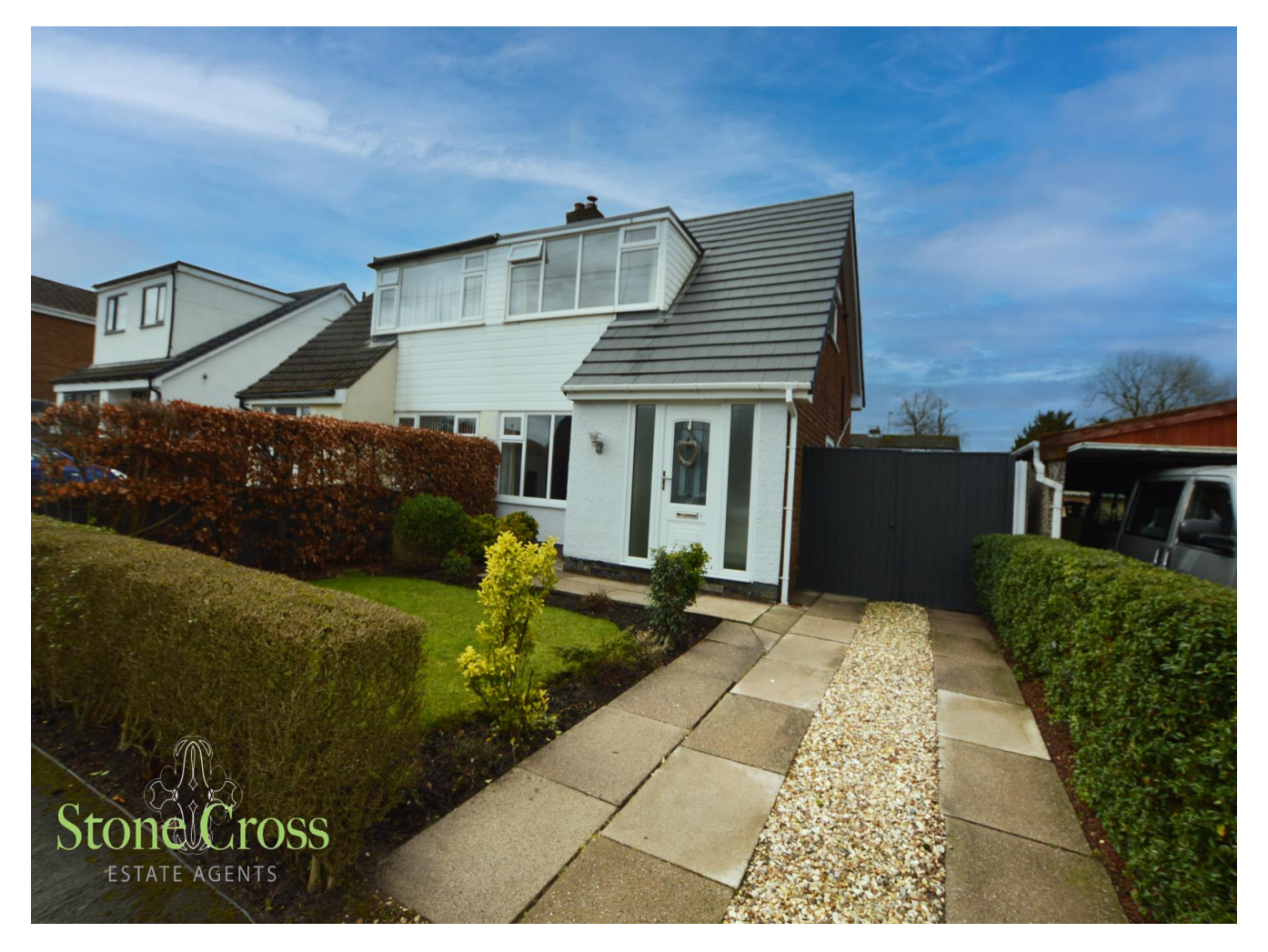
Tarvin Close, Lowton, WA3 2NX

Stone Cross Estate Agents are delighted to be able to bring to the market this three bedroom semi detached property. It is is located in a sought-after area in the village of Lowton. Within walking distance, you will find a wide selection of local amenities, such as schools, shops and pubs/eateries. Well positioned for transport links, i.e bus route, the East Lancashire Road, and the National Motorway Network. This property comprises of entrance hallway, lounge, oranger, kitchen and family bathroom to the ground floor and three bedrooms to the first floor. Externally there is a driveway to the front and to the rear is a spacious enclosed garden with laid to lawn and is not overlooked. ***CONTACT US NOW TO ARRANGE A VIEWING****