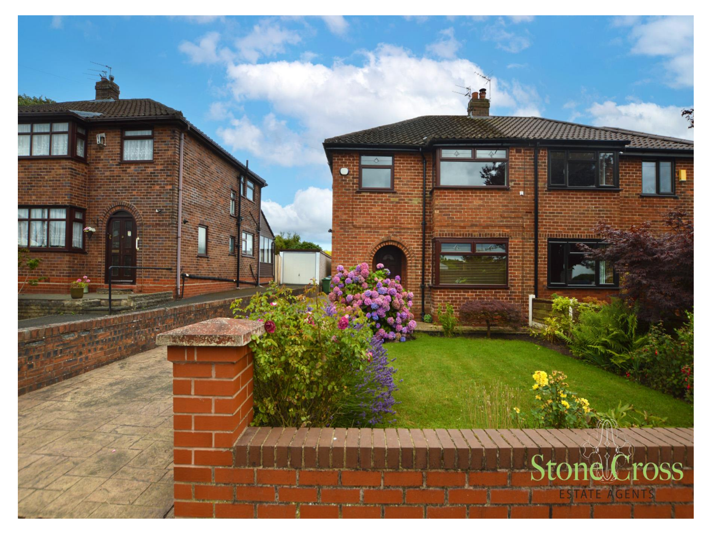
Barn Lane, Golborne, WA3 3NS

Stone Cross Estate Agents are thrilled to present this charming three-bedroom semi-detached home, offered with NO CHAIN. Nestled in one of Golborne Village's most sought-after locations, this property is within walking distance of local shops, primary and secondary schools, and offers excellent commuter links via the East Lancashire Road (A580) and national motorways. While in need of some modernisation, this home has immense potential. The ground floor features an entrance hall, lounge, kitchen, and an inviting orangery. Upstairs, you'll find three bedrooms and a bathroom. Outside, the property boasts a driveway leading to a detached garage, providing ample off-road parking, with a beautifully maintained front garden. The rear garden, with its scenic field views, offers a peaceful and private retreat. Don't miss out on this fantastic opportunity! **Please Contact Us To Arrange A Viewing 01942 356266**