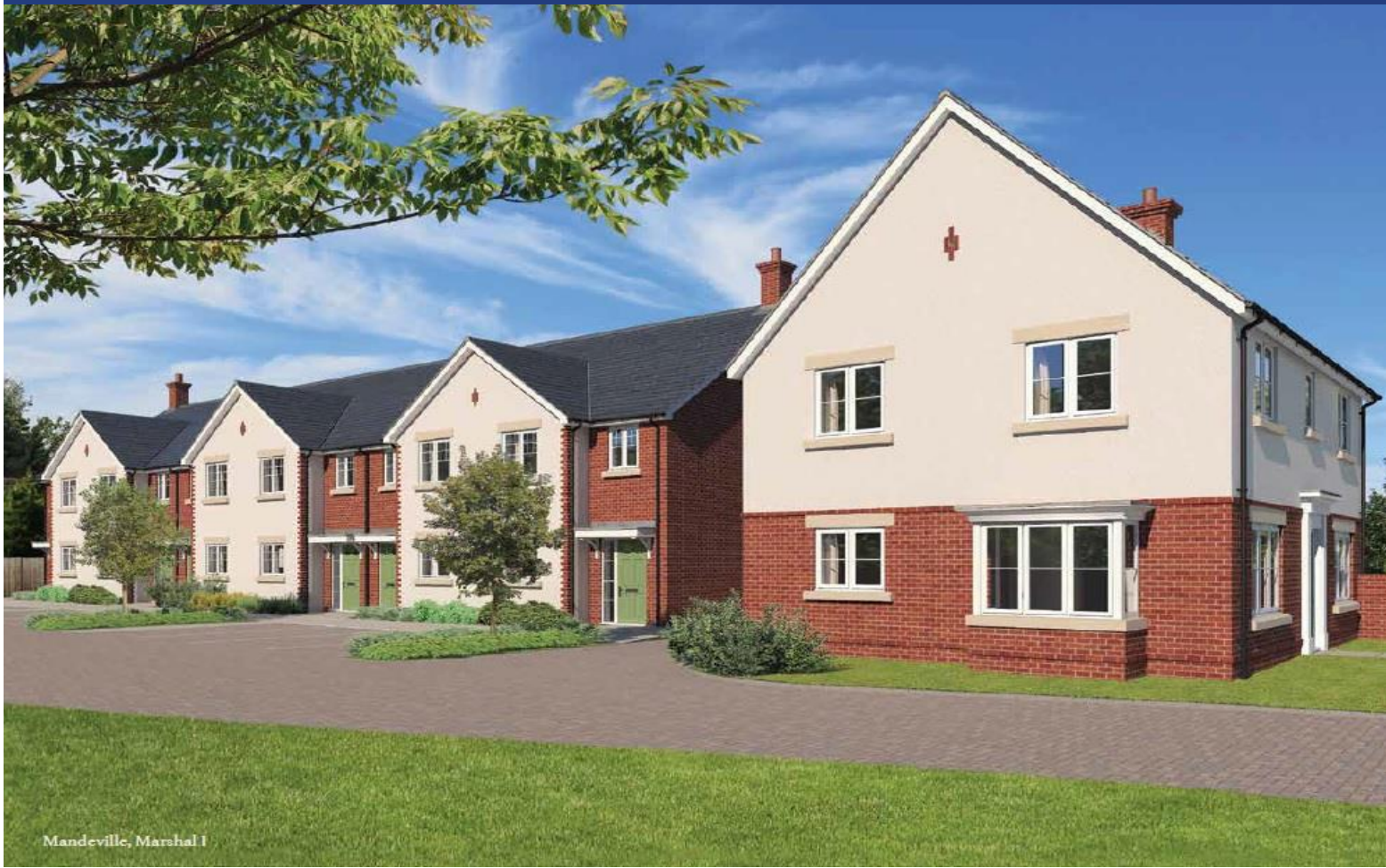
Mandeville, Marshal 1