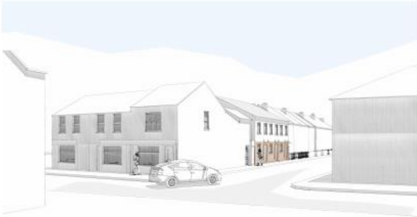
View One: East/West Dynevor Street

Tredworth Motorcycles, 64-68 High Street, Gloucester