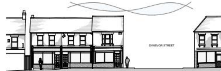
South West Proposed Elevation