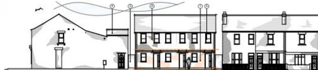
North East Proposed Elevation