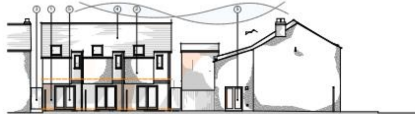
South East Proposed Elevation