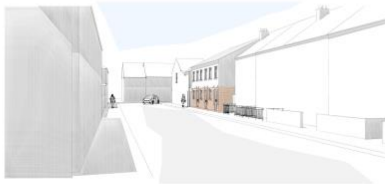
View Two: West/East Dynevor Street