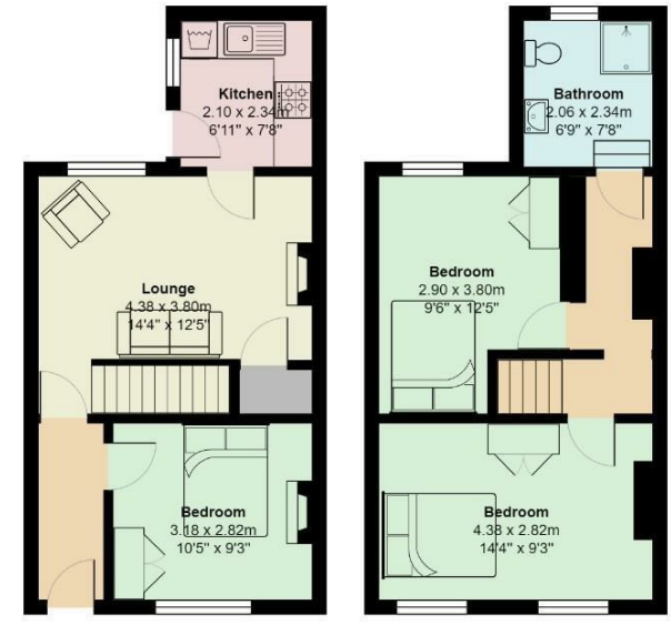
Treherbert Street, Cathays

Total Area: 69.7 m 2 ... 751 ft 2 All measurements are approximate and for display purposes only