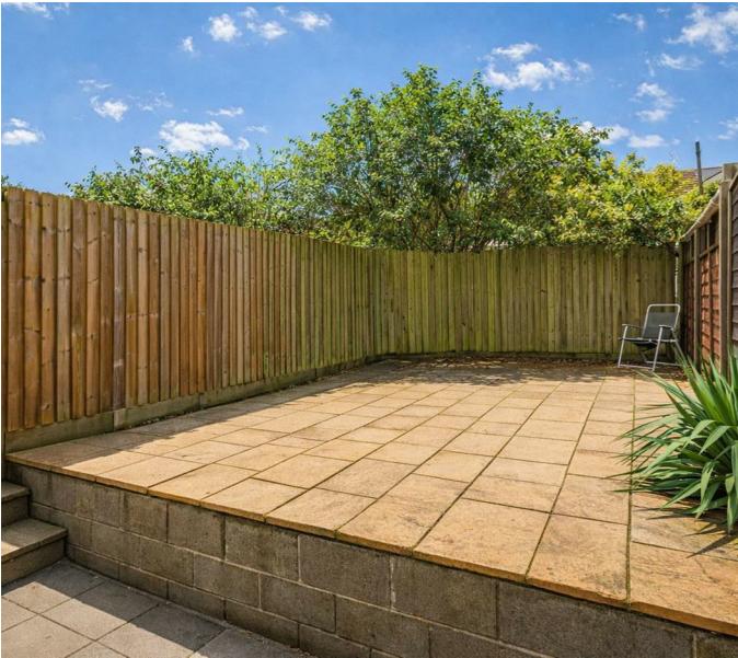
Treherbert Street, Cathays