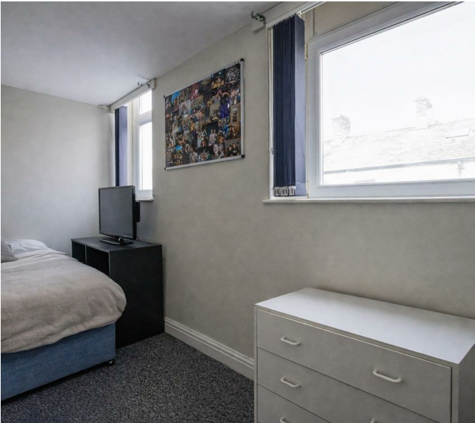
Hirwain Street, Cathays