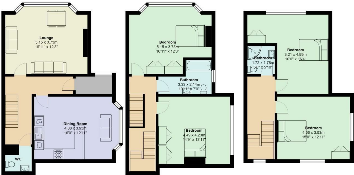
Marlborough Road, Roath Park

Total Area: 165.9 m² ... 1786 ft² All measurements are approximate and for display purposes only