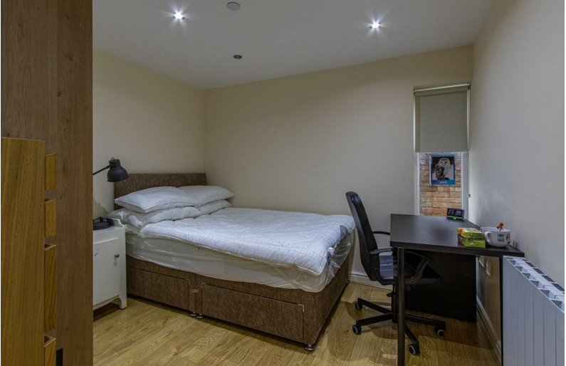
North Road, Gabalfa