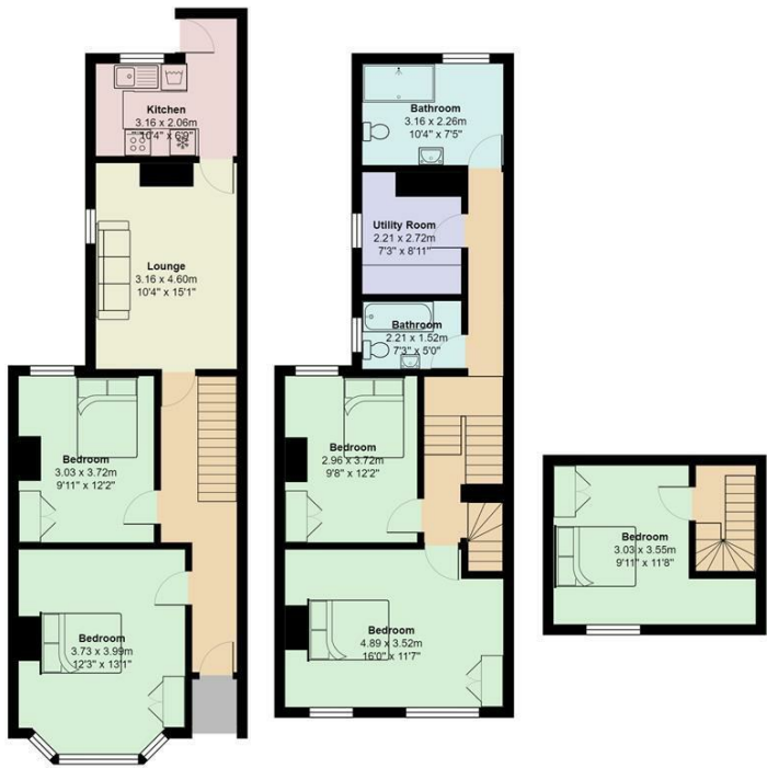
Mackintosh Place, Roath

Total Area: 137.2 m² ... 1477 ft² All measurements are approximate and for display purposes only.