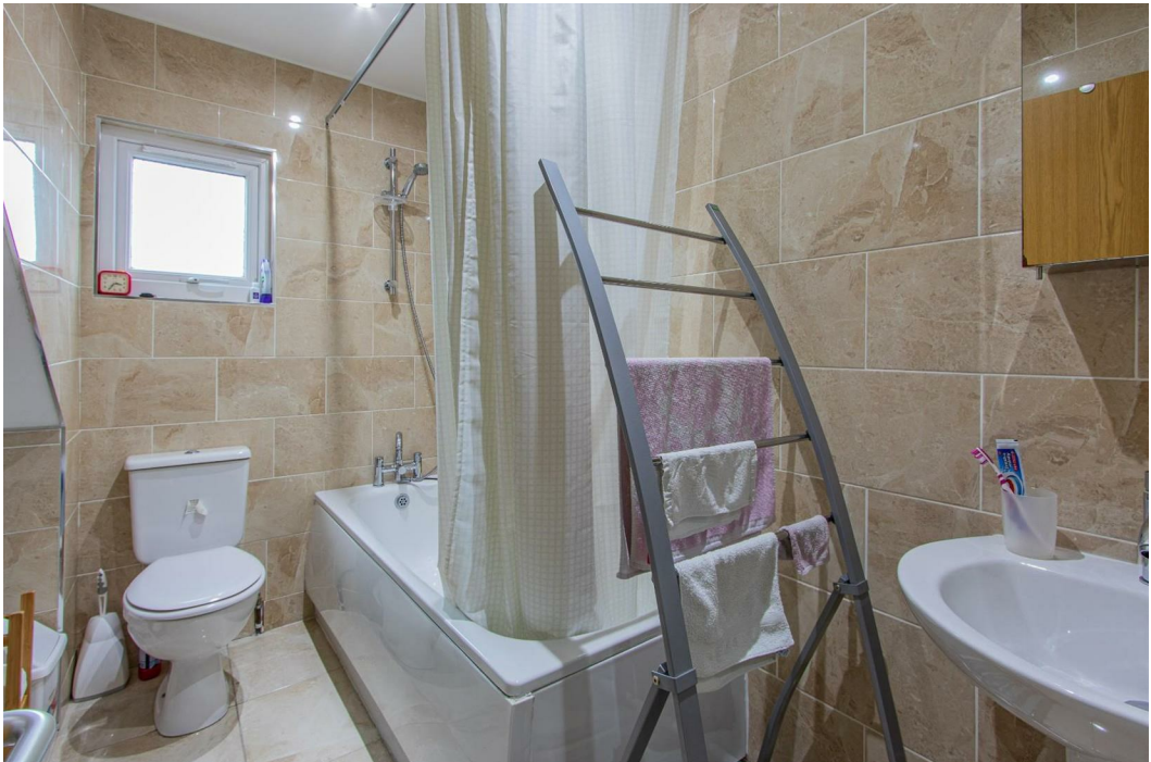
North Road, Gabalfa