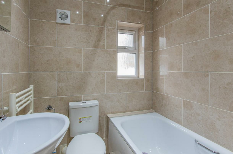
Gordon Road, Roath