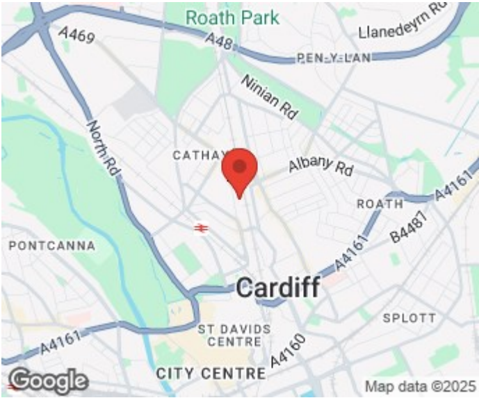
Rhymney Street, Cathays.