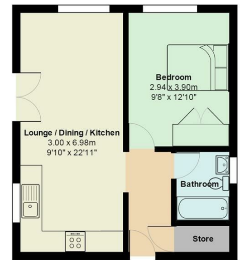
Howard Terrace, Roath