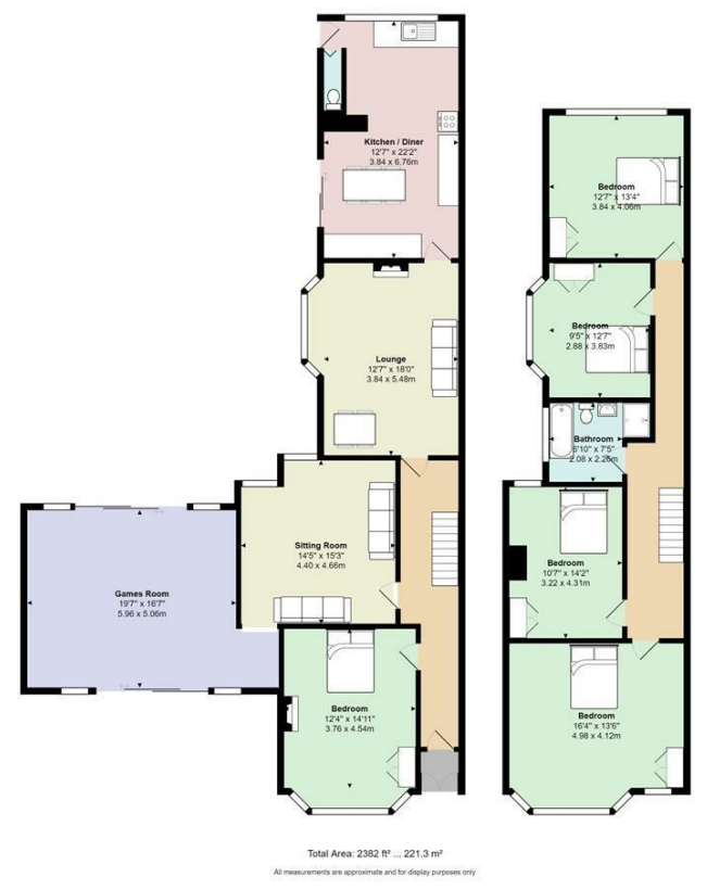
Lake Road West, Roath Park