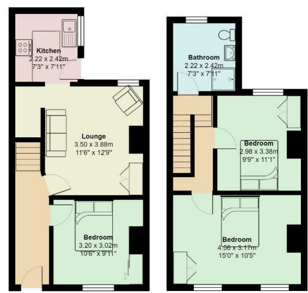
Treherbert Street, Cathays

Total Area: 74.3 m 2 ... 799 ft 2 All measurements are approximate and for display purposes only