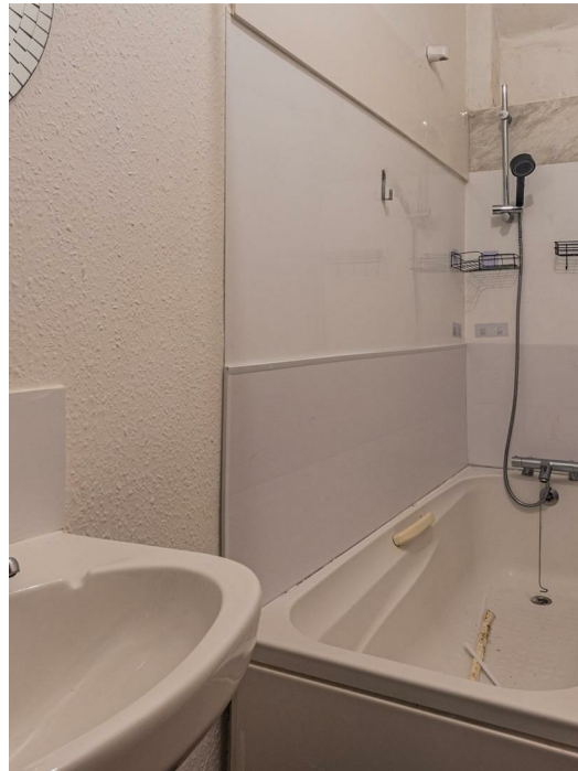
Richmond Road, Roath