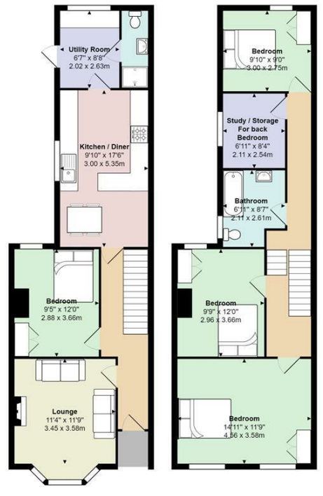
Manor Street, Heath

Total Area: 1253 ft 2 ... 116.4 m 2 All measurements are approximate and for display purposes only.