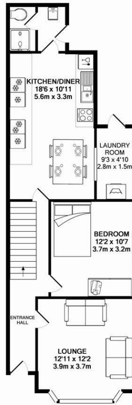
GROUND FLOOR APPROX. FLOOR AREA 669 SQ.FT. (62.1 SQ.M.)