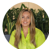
Glenroy Street, Roath