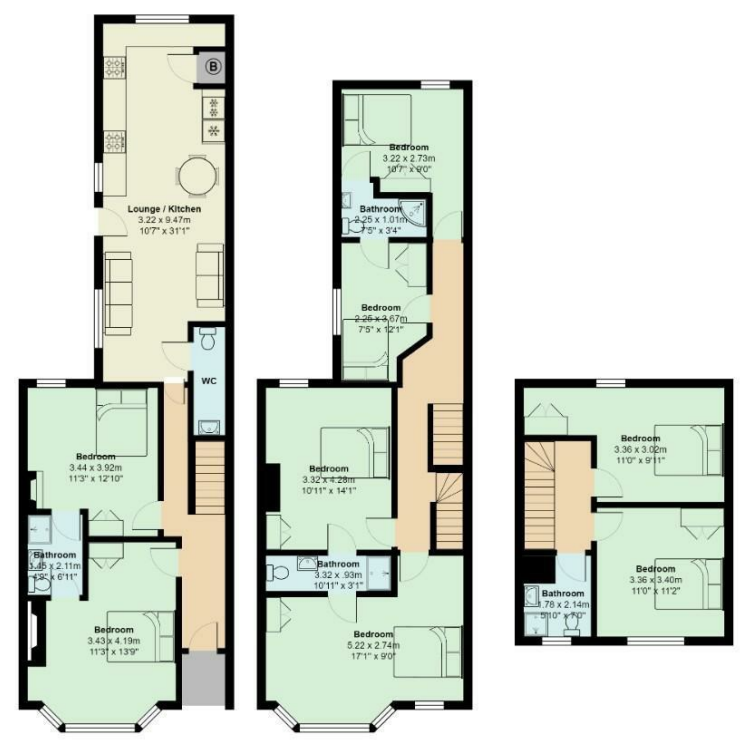
Colum Road, Cathays

Total Area: 180.6 m 2 ... 1944 ft 2 All measurements are approximate and for display purposes only