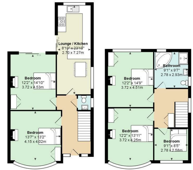
Windermere Avenue, Roath Park

Total Area: 1361 ft 2 ... 126.5 m 2 All measurements are approximate and for display purposes only