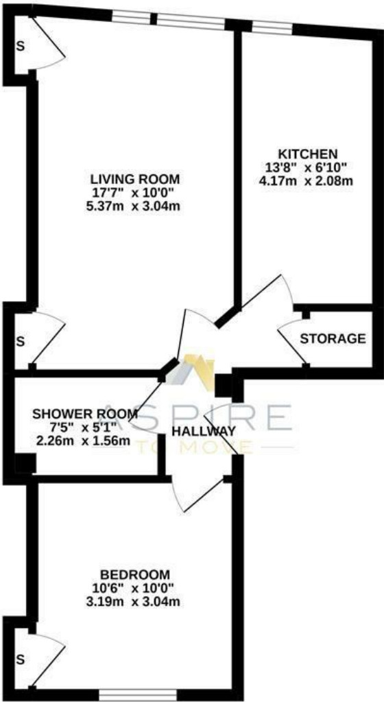
SECOND FLOOR 456 sq.ft. (42.3 sq.m.) approx.