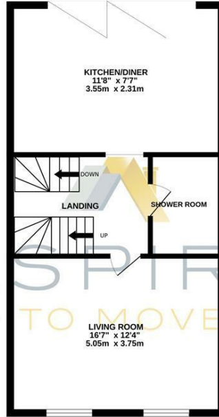
1ST FLOOR 530 sq.ft. (49.2 sq.m.) approx.