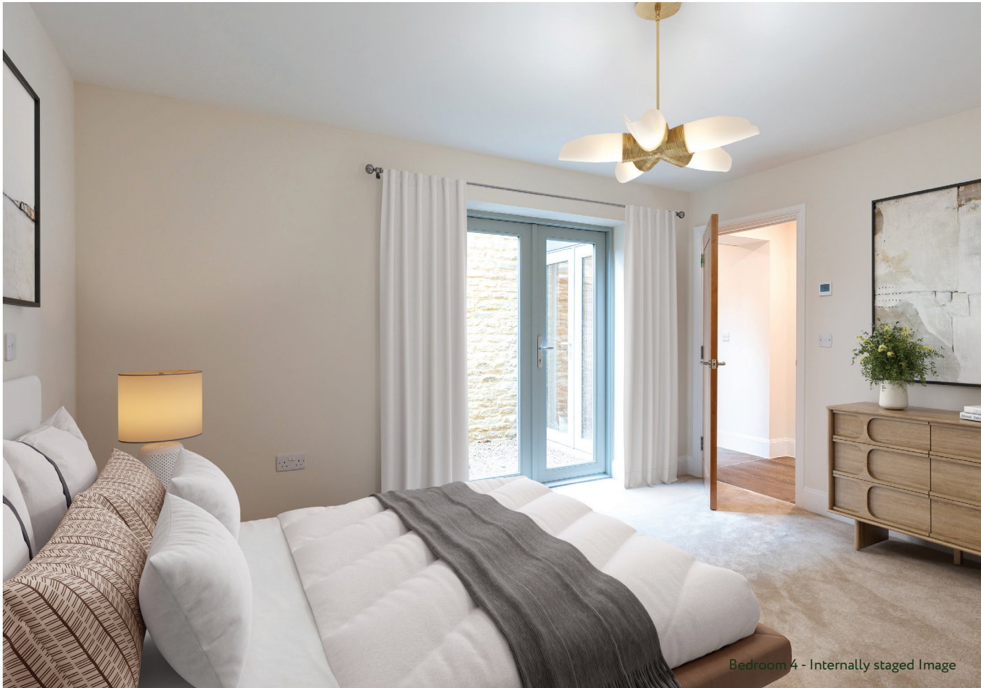
Bedroom 4 - Internally staged Image