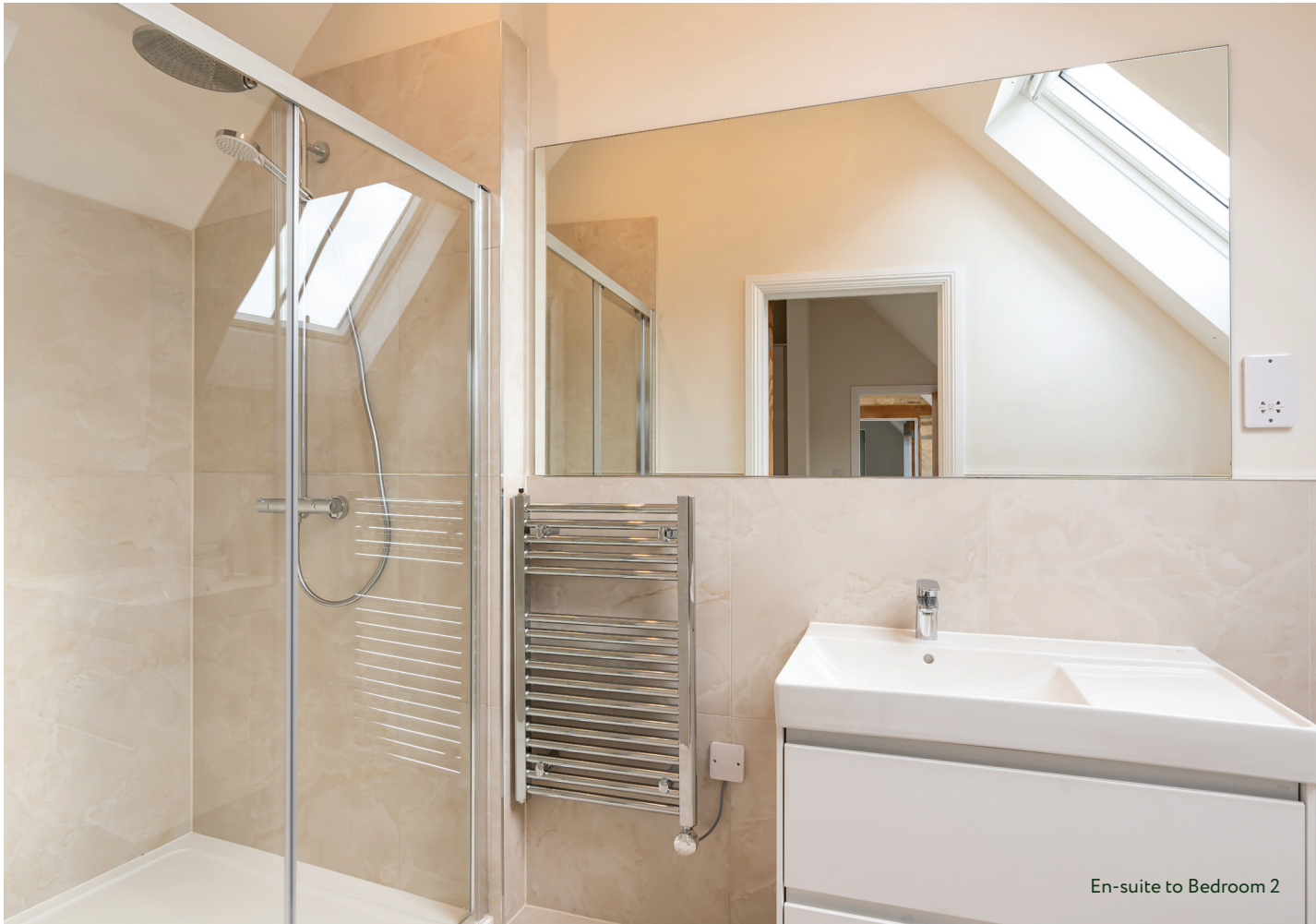
En-suite to Bedroom 2