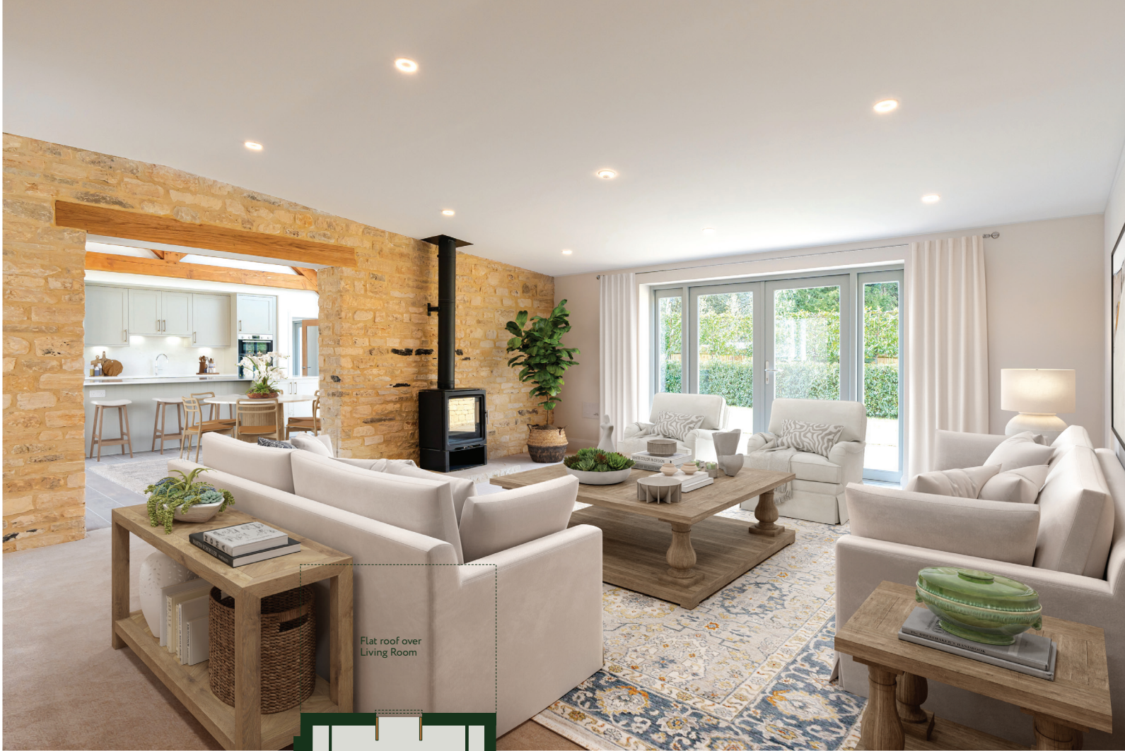
Internally staged Image