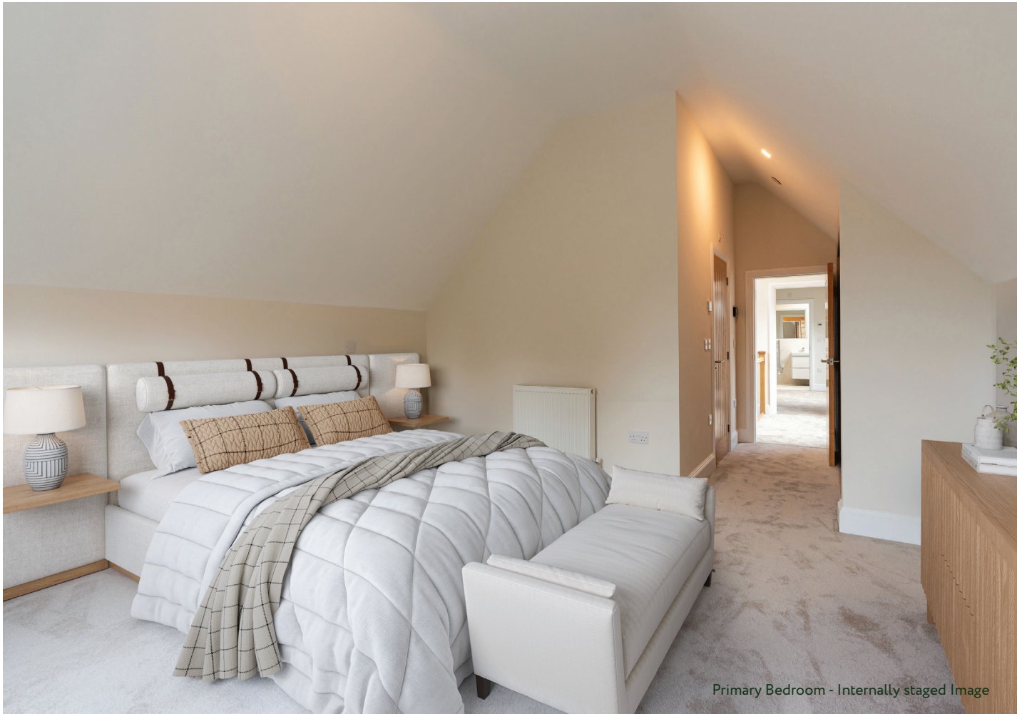
Primary Bedroom - Internally staged Image