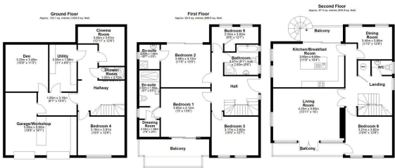
Total area: approx. 204.1 sq. metres (2105.1 sq. feet)