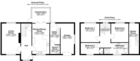
Total area: approx. 137.8 sq. metres (1483.2 sq. feet)