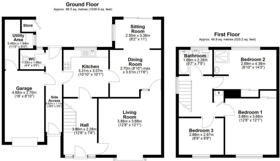
Total area: approx. 145.3 sq. metres (1564.1 sq. feet)