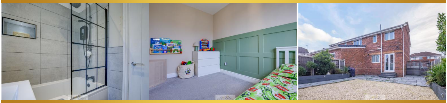
GROUND FLOOR 286 sq.ft. (26.6 sq.m.) approx.