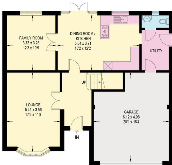
GROUND FLOOR 72.1 SQ M / 776 SQ FT

APPROXIMATE GROSS INTERNAL AREA = 149.5 SQ M / 1609 SQ FT GARAGE = 28.1 SQ M / 302 SQ FT TOTAL = 177.6 SQ M / 1911 SQ FT