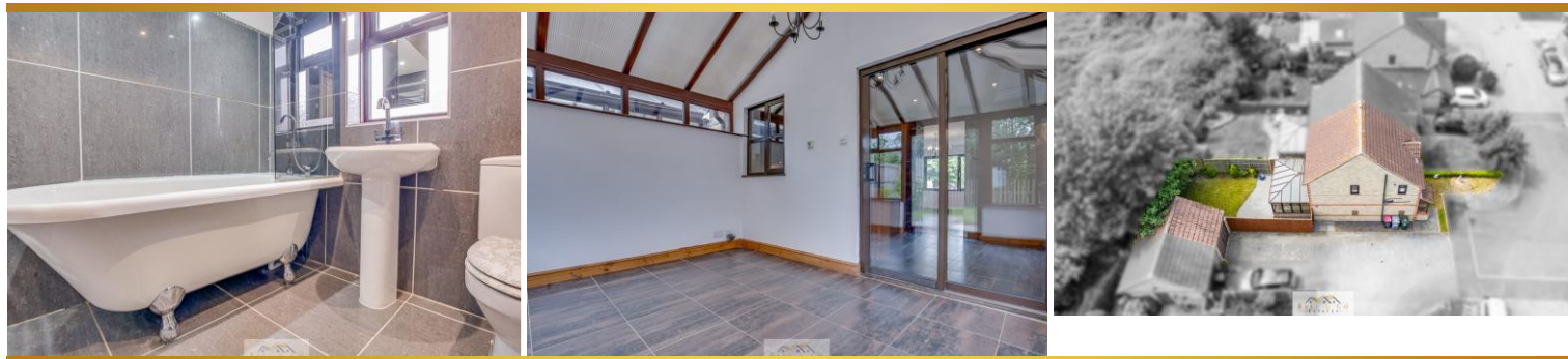
GROUND FLOOR 484 sq.ft. (45.0 sq.m.) approx.